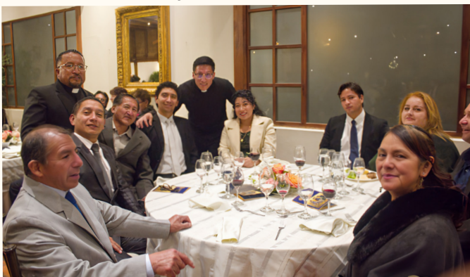
Photo: Seminarians with brothers and sisters at the Gala Dinner.