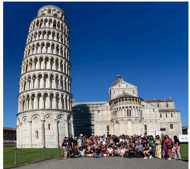
Photo: Group of pilgrims in Pisa, next to the famous Leaning Tower.

We assure all of you of our deepest gratitude and prayers, and we ask you to continue praying for us, so that we may faithfully respond to God's call for us and, one day, be shepherds after his own heart. May all this be for the glory of God and the good of the Church.