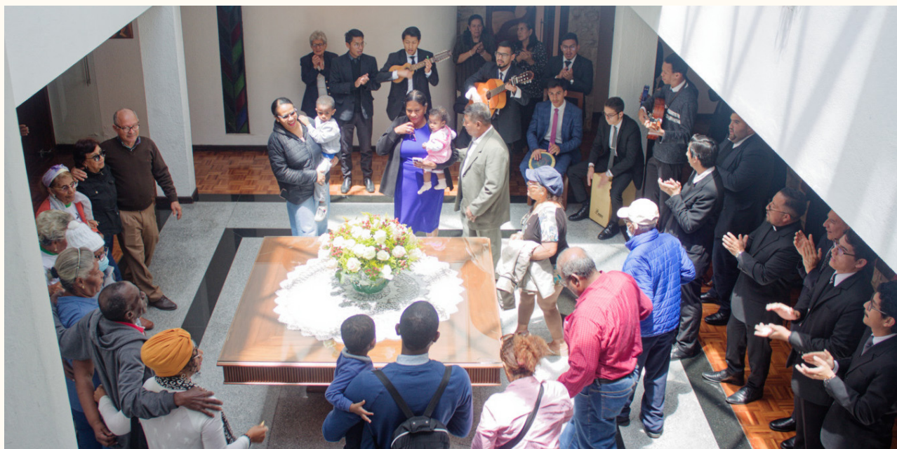
Photo: Seminarians welcoming the brothers and sisters who visited the Seminary.

O n October 26, 2025, we hosted the children and brothers of the First Community of San Martin de Porres of Esmeraldas. At their arrival, the atmosphere filled with fraternity and enthusiasm, reviving the communion we experience in the faith. During the visit, we showed the seminary, visiting the different spaces in which we lived, pray and study. We also share the occasions to spark the new aesthetics of the seminary, which will help us deeply take occasion to explain the New Aesthetic and spiritual significance for community life. Next, two of our seminarians offered a catechesis, sharing a reflection and inviting everyone to renew their own commitment to vocation and service in the Church. Before lunch, we recited the Midday Prayer together, a moment that reinforced the spirit of communion through all the present.