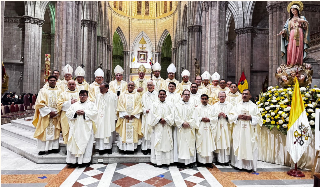
Photo: Bishops and priests during the celebration in thanksgiving for the election of Pope Leo XIV.