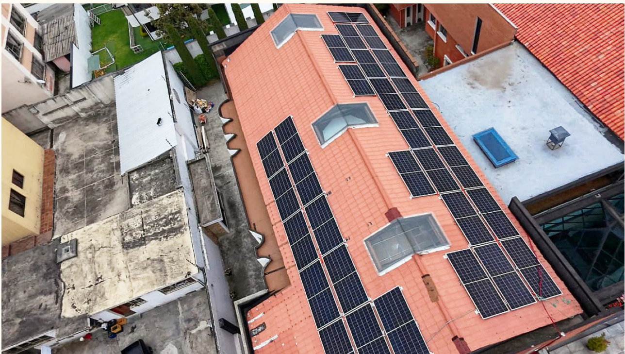
Photo: View of the completed solar panel project.

W e are happy to inform you that the solar panel installation project in our seminary has been completed satisfactorily. This important work marks a new step towards sustainability and common home care, allowing us to responsibly test the natural resources that God places in our power.