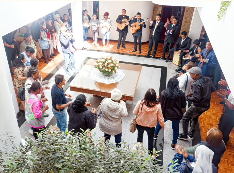
Photo: The Seminary joyfully welcomed the pilgrims.

On August 31st, we had the joy of receiving a visit from a group of pilgrims from the parish of San Martín de Porres in Esmeraldas, who stopped by on the way to Lima, Peru. We welcomed them with great enthusiasm, sharing a fraternal moment with them. Throughout their visit, we enjoyed an atmosphere full of camaraderie, shared experiences, and deeply thanked them for their effort and dedication on this pilgrimage, praying that the Lord continue to guide their path.