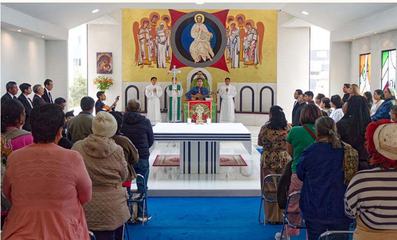
Photo: Celebration of Lauds with the pilgrims.