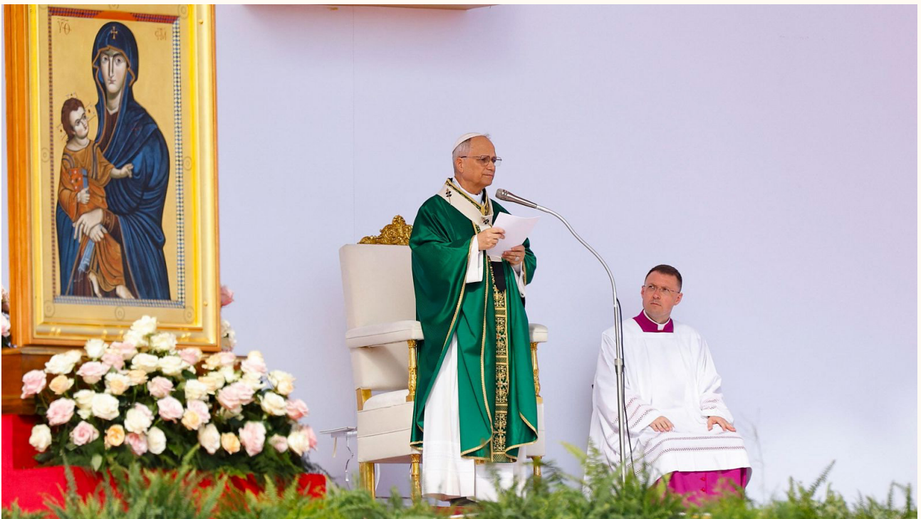
Photos: Pope Leo XIV presided over the Eucharist of the Great Jubilee for Young People.

T he pivotal moment of our trip was our arrival at Tor Vergata, where we participated in the Great Jubilee of Youth. There, in an unforgettable prayer vigil, we accompanied Pope Leo XIV, who exhorted us not to be afraid to follow Christ with radicalism and joy. Hundreds of thousands of young people from around the world joined together in unity to praise the Lord and renew our faith under the starry sky of Rome. The following day, we joyfully participated in Holy Mass presided by the Holy Father, a culminating moment in which, as an ecclesial community, we celebrated the Eucharist in the unity of faith and the diversity of our origins.