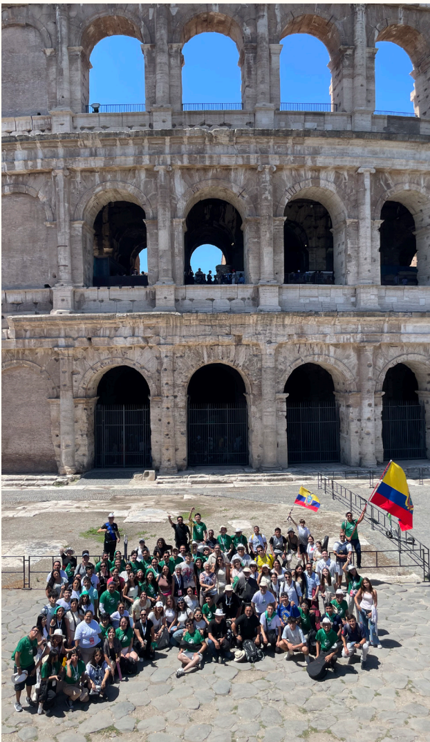
Photo: Pilgrims next to the Roman Colosseum.