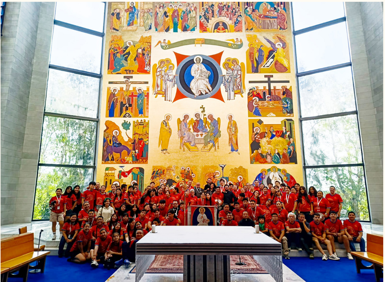
Photo: Group of pilgrims visiting the chapel of the RMS in Rome during the Great Jubilee of Youth.