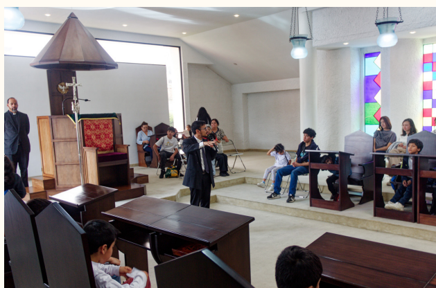
Photo: Pilgrim children receiving catechesis in the Sanctuary of the Word.

A fter the welcome, we offered them a refreshment, and we were able to share moments of conversation, laughter, and fraternal closeness. Finally, we accompanied them on a tour of the different areas of the seminary, providing them with catechesis tailored to their age, explaining the meaning and mission of each room: the chapel, the library, the dining room, the Chapel and the Sanctuary of the Word. It was a wonderful opportunity for us to share with them our love of God and the meaning of our missionary vocation.