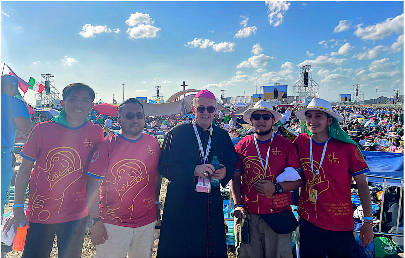
Photos: Seminarians with the Bishop of Manfredonia-Vieste-San Giovanni Rotondo during the meeting in Tor Vergata.

T he pivotal moment of our trip was our arrival at Tor Vergata, where we participated in the Great Jubilee of Youth. There, in an unforgettable prayer vigil, we accompanied Pope Leo XIV, who exhorted us not to be afraid to follow Christ with radicalism and joy. Hundreds of thousands of young people from around the world joined together in unity to praise the Lord and renew our faith under the starry sky of Rome. The following day, we joyfully participated in Holy Mass presided by the Holy Father, a culminating moment in which, as an ecclesial community, we celebrated the Eucharist in the unity of faith and the diversity of our origins.