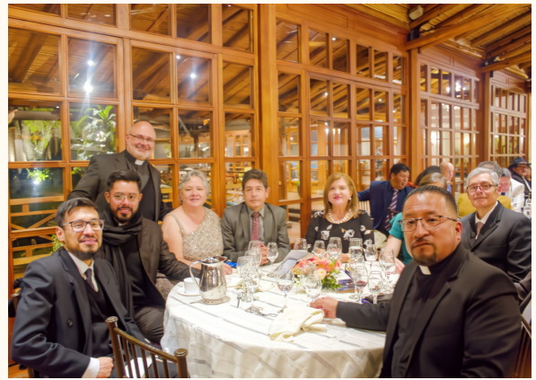
Photo: Seminarians and brothers and sisters of the communities during the Dinner.