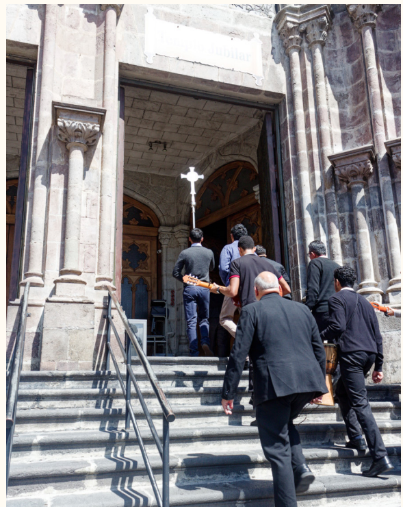
Photo: Seminary entering the Basilica.

T hen we had a profound moment of adoration of the Blessed Sacrament, in which, in silence and prayer, we offered our lives to the Lord, renewing our desire to follow him with fidelity and love. Finally, we visited the “Fr. Jimmy Arias Piedra” Nativity Scene, recognized as the largest in South America, marveling at its beauty and the message of hope it conveys. It was a morning of faith, fraternity, and encounter with God, which strengthened in all of us the commitment to live our vocation and serve the Gospel joyfully.