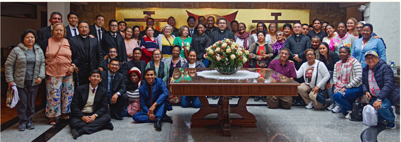
Photo: Pilgrims and members of the Seminary together at the end of the visit.

We pray to the Lord for these brothers and sisters who have visited us. May the Father's grace strengthen and encourage them in their mission, and may they continue to be witnesses of faith on their journey.