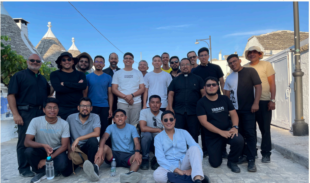
Photo: The Seminary in Alberobello, (Puglia), visiting the famous "Trulli".