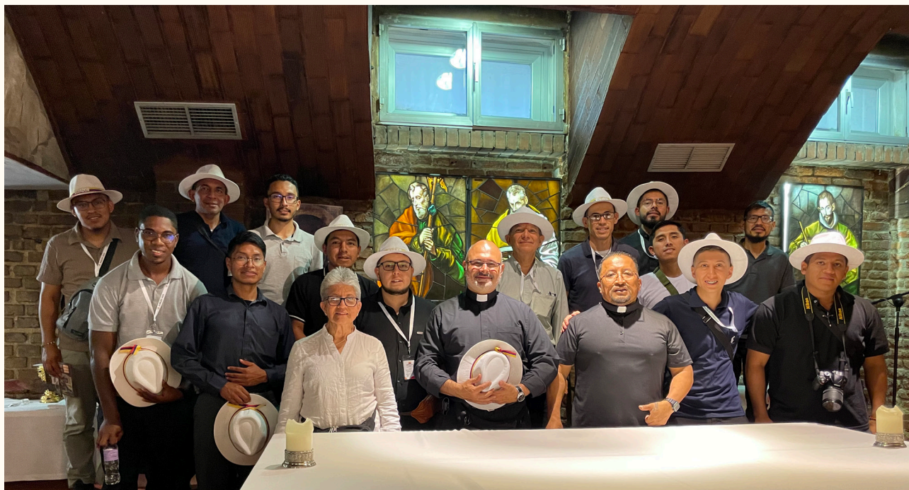
Photos: At the start of our pilgrimage we visited Kiko's house in Madrid.

With profound gratitude to the Lord, we wish to share the experience of faith we experienced during the months of July and August, when we had the chance to participate as a seminary in the pilgrimage that culminated in the Great Jubilee of Youth in Rome. Our itinerary took us to various cities in Italy, visiting places steeped in history, beauty, and holiness. After spending a few hours in Madrid, where we were able to visit Kiko's home—including his room where he had the vision of the Virgin Mary inviting him to form Christian communities like the Holy Family of Nazareth—and the Redemptoris Mater Seminary, our Italian journey began in Turin: here we visited the Chapel of the Holy Shroud, the Church of Mary Help of Christians, and the Small House of Divine Providence in Cottolengo.