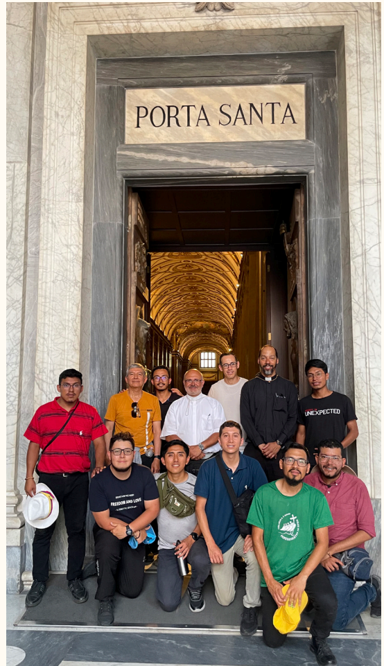
Photo: Seminary in the Basilica of Saint Mary Major.