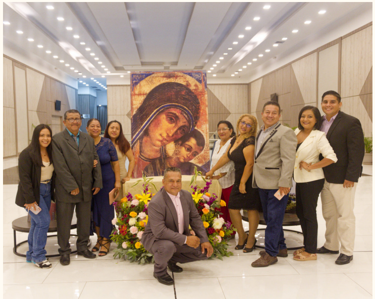
Photo: Brothers from different parishes in Guayaquil attended the Gala Dinner.