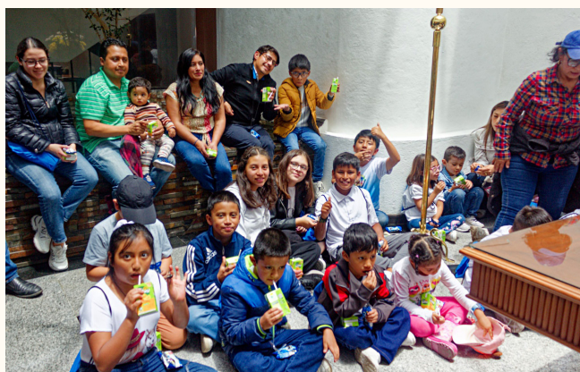
Photo: We serve a snack to the pilgrim children.

W e concluded the day with a moment of prayer, in which everyone—children, parents, and seminarians—raised and offered thanks to the Lord for the gifts we had received. We thank God for allowing us to share this very special encounter. We pray for these children and their families, that the Lord may bless them and accompany them always, and that new vocations to the service of the Church and evangelization may arise from among them.