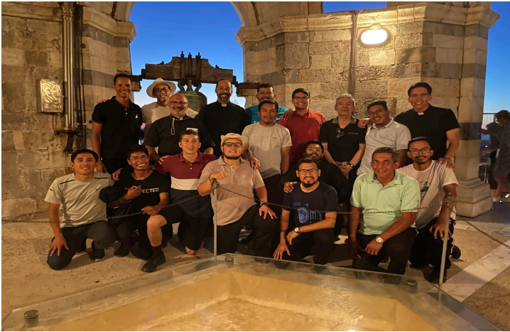
Photo: Seminary at the top of the Leaning Tower of Pisa.

After the jubilee pilgrimage, we had a time of vacation as a seminary in Puglia, where we were welcomed by the brothers of Ginosa and Marina di Ginosa (TA) and Matera: a sincere thank you to all those who were so attentive to us and gave us the opportunity to experience some unforgettable days.