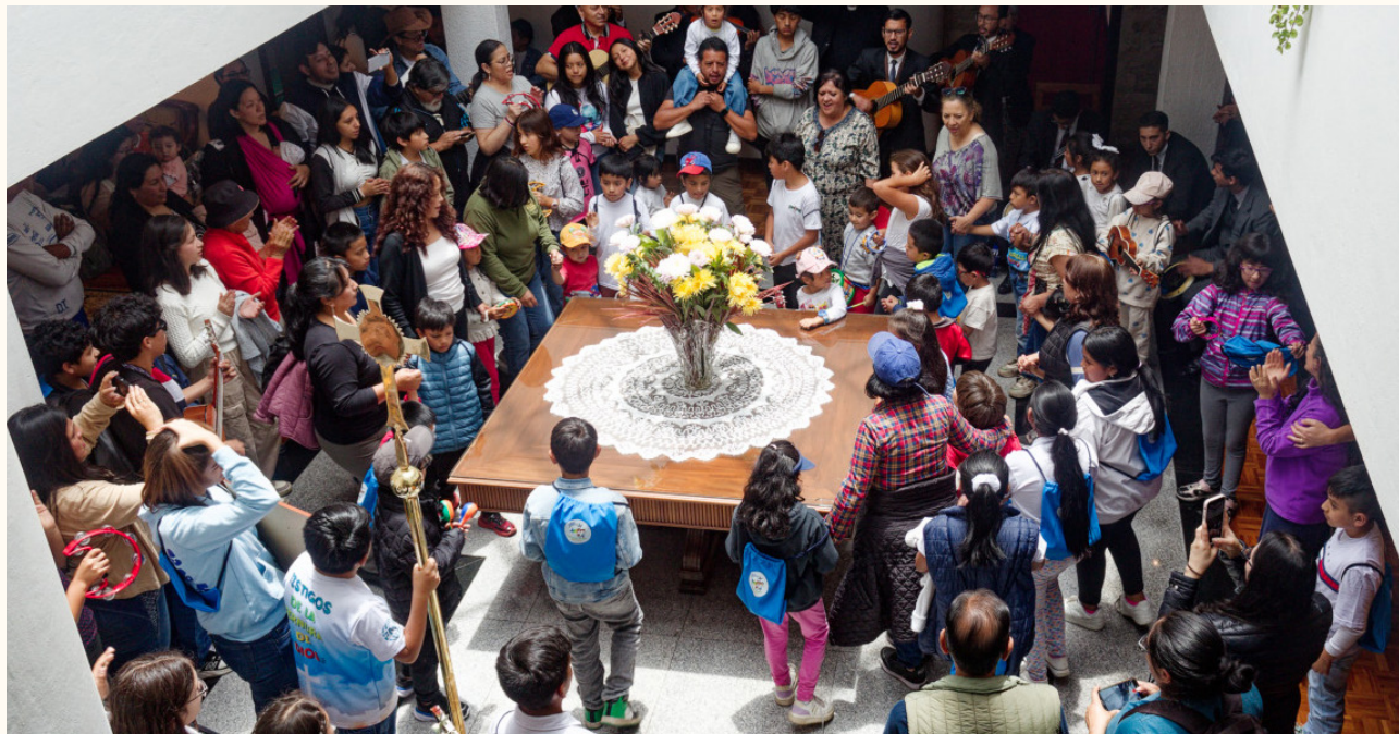
Photo: Children and their parents dancing at the Seminary.

O n September 20, 2025, we had the joy of receiving a visit from a group of children from different parishes in Quito, who enthusiastically celebrated the Children's Jubilee. Their presence filled our formation house with life and hope, reminding us of the simplicity and purity with which we are all called to live the faith.