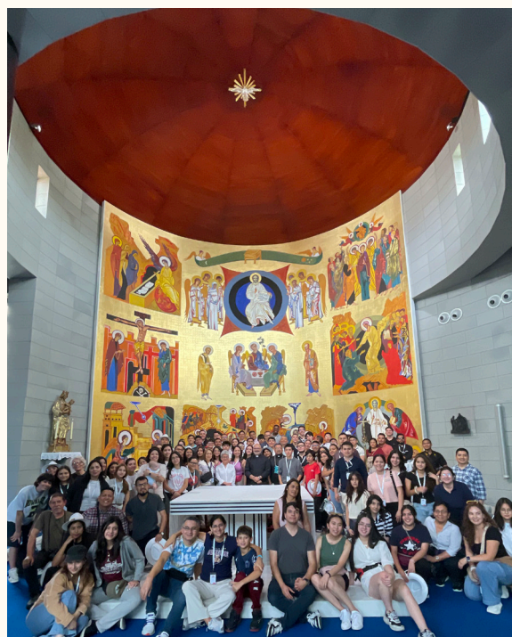
Photos: The group of pilgrims in the Chapel of the RMS in Madrid.

After spending a morning in Milan with its spectacular Duomo (Cathedral), our pilgrimage took us to Schio, where the body of Saint Josephina Bakhita is buried; then Venice, with its spiritual and artistic riches; Padua, where we venerated the relics of Saint Anthony; Assisi; Loreto, site of the Basilica of the Holy House; San Giovanni Rotondo, where the body of Saint Pio of Pietrelcina rests; Monte Sant'Angelo; Pompeii; Rome; Montefiascone and Bolsena; Florence; and Pisa, with its iconic leaning tower; Siena, the land of Saint Catherine; and Empoli, each with its own unique mark on our journey of faith. We made this pilgrimage with brothers and sisters of the Neocatechumenal Way, mostly young people from different communities in Quito and Guayaquil. With them, we shared songs, celebrations, exhaustion, and joy, experiencing the communion of the Church.