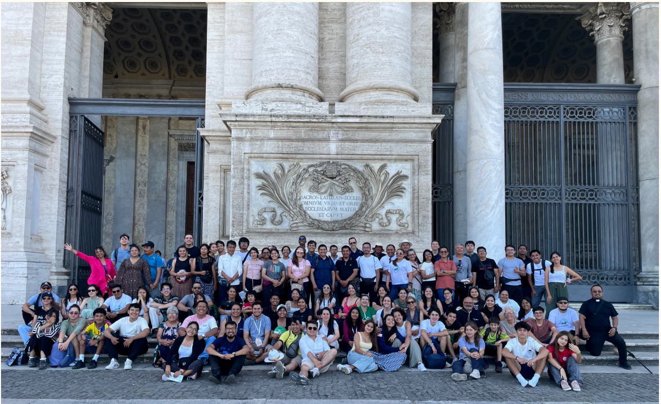
Photo: Jubilee pilgrims at the Basilica of St. John Lateran, Rome, Italy.