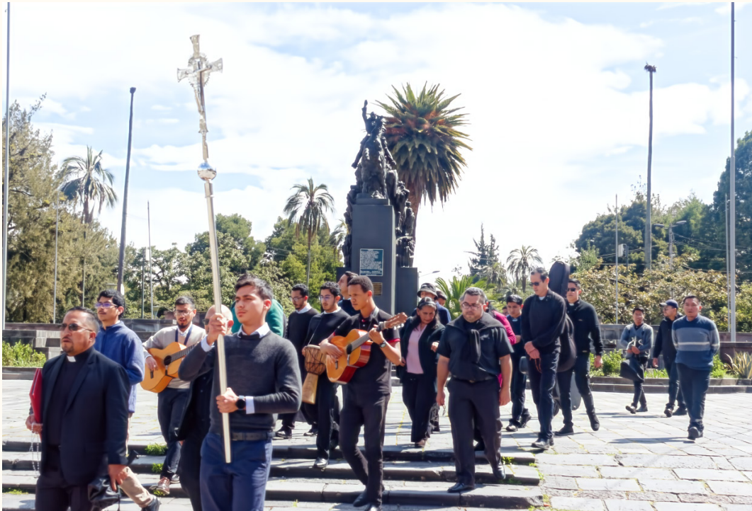
Photo: We began our pilgrimage to the Basilica of the National Vow.

O n the morning of October 18, 2025, we made a pilgrimage to the Basilica of the National Vow, in the city of Quito. During the journey, we sang the Rosary in honor of the Blessed Virgin Mary, offering our prayers for peace in our country, for priestly vocations, and for the evangelizing mission of the Church. Upon arriving at the Basilica, we crossed the Holy Door on the occasion of the Jubilee, experiencing with joy and gratitude this sign of grace and reconciliation.