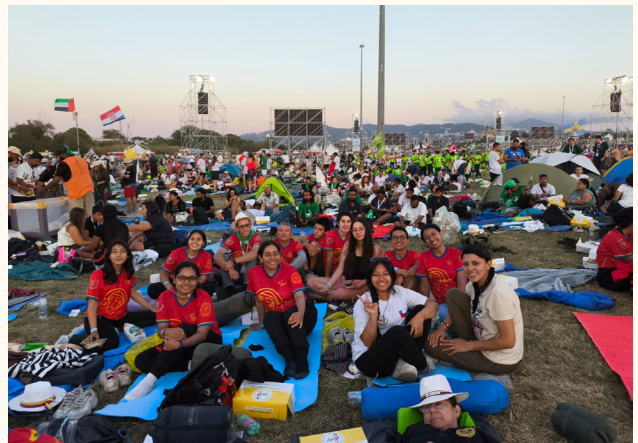
Photo: Pilgrims at the Vigil with Pope Leo XIV in Tor Vergata.